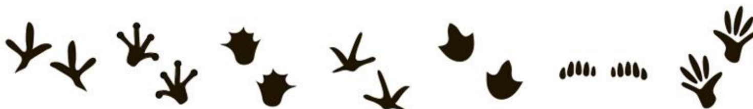
Pigeon Frog Otter Turkey Partridge Mole Shrew