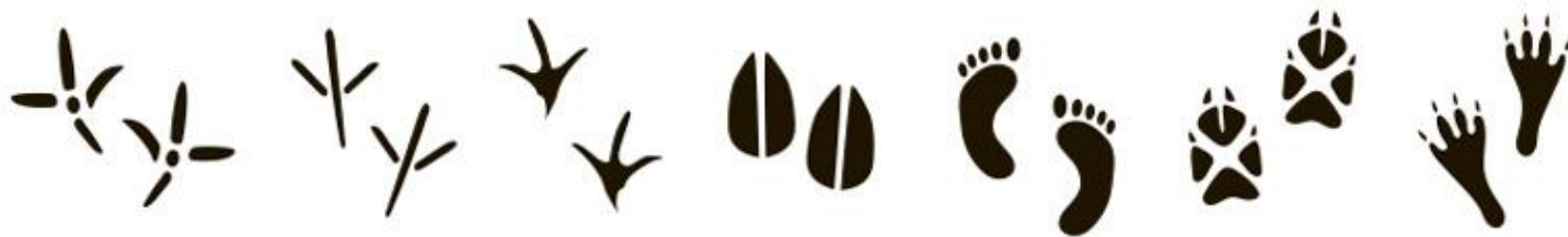
Grouse grey Heron Chicken Roe Person Fox Hare