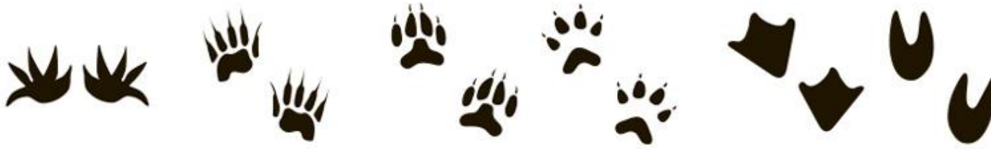
Hedgehog Badger Dog Cat Goose Pig