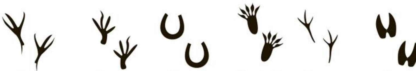
Crow Mouse Horse Squirrel Sparrow Deer