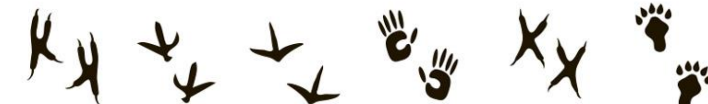
Woodpecker Pheasant Heron Person Owl Otter